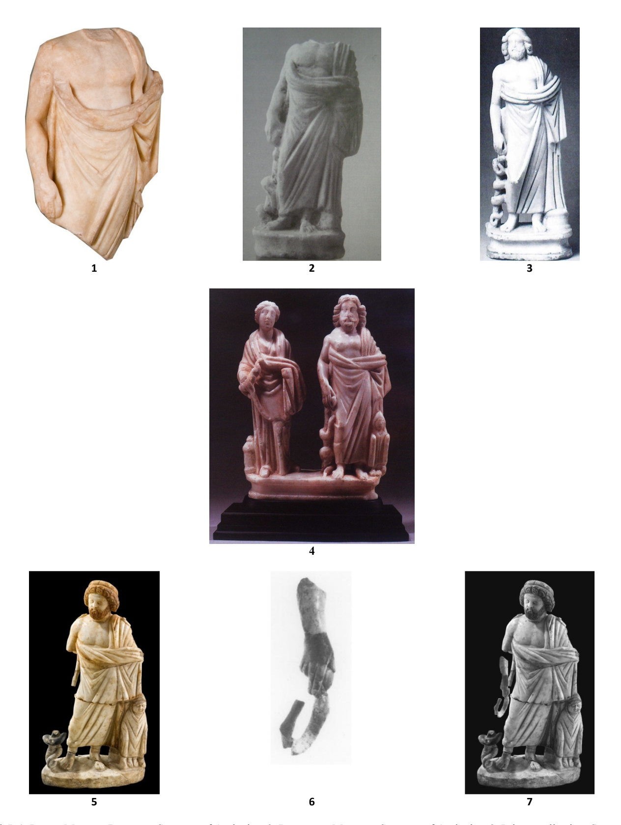
Pl. I. 1. Rome, Museum Barracco. Statuette of Asclepius; 2. Pergamon, Museum. Statuette of Asclepius; 3. Private collection. Statuette of Asclepius; 4. Private collection. Statuette of Asclepius; 5. Corinth, Archaeological Museum of Ancient Corinth. Statuette of Asclepius; 6. Corinth, Archaeological Museum of Ancient Corinth. Right forearm with egg; 7. Corinth, Archaeological Museum of Ancient Corinth. Reconstruction of statuette with forearm (reconstruction by author).