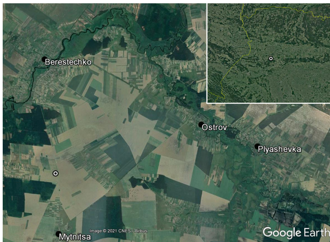
Pl. V. Place where coins were found (marked with white sign). Modern borders are marked by yellow lines (source: Google Earth).