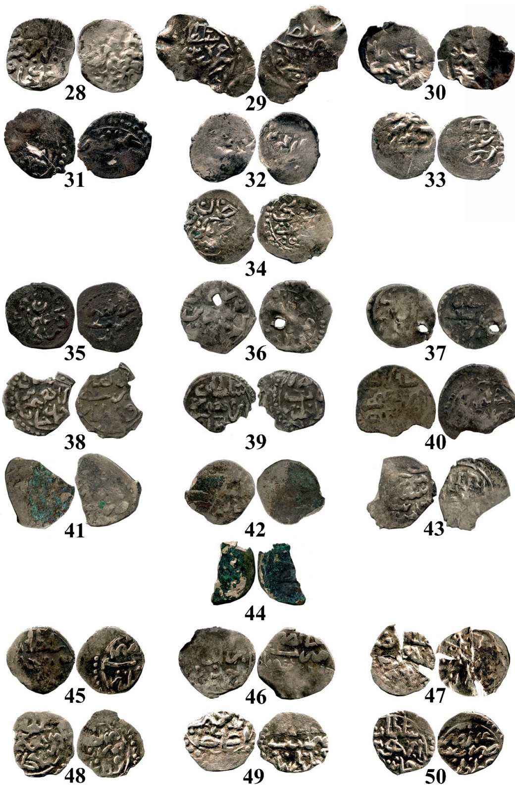
Pl. II. Coins from Berestechko battlefield. Cat. Nos. 28-50.